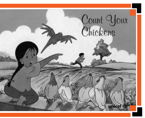
Through comic books and animated cartoons, Meena has influenced parents and become a role model for girls in South Asia. Girls in Nepal say that, because of comic books such as this one, they can attend school regularly.

performs in a village square or an urban slum. As many as 1,000 people attend, and the performance is interactive. After the performances, actors—who are trained in HIV counseling—discuss the educational content with audience members (38, 91).